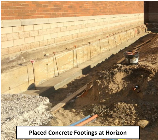
Placed Concrete Footings at Horizon