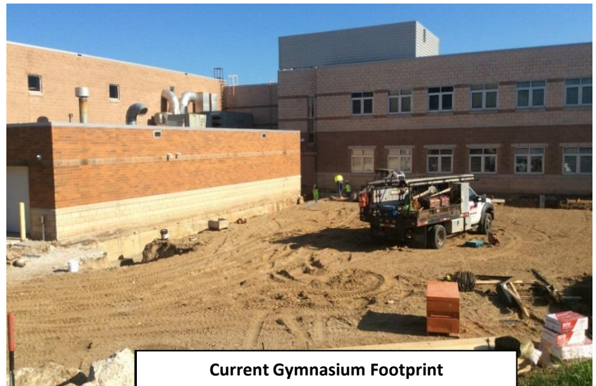
Current Gymnasium Footprint