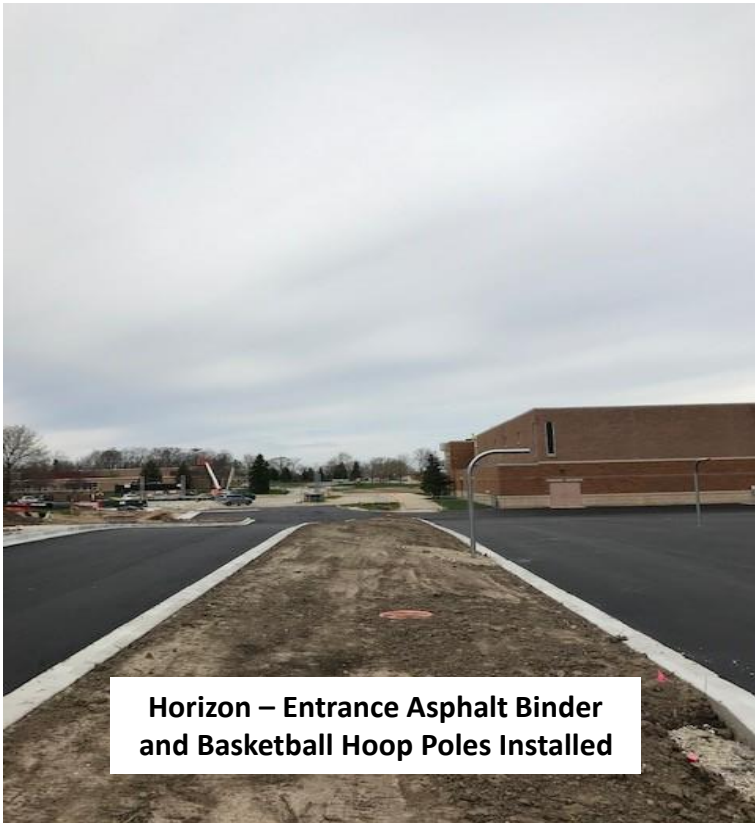
Horizon – Entrance Asphalt Binder and Basketball Hoop Poles Installed