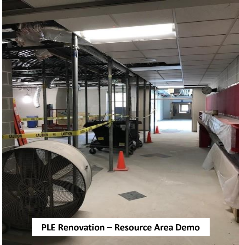
PLE Renovation – Resource Area Demo