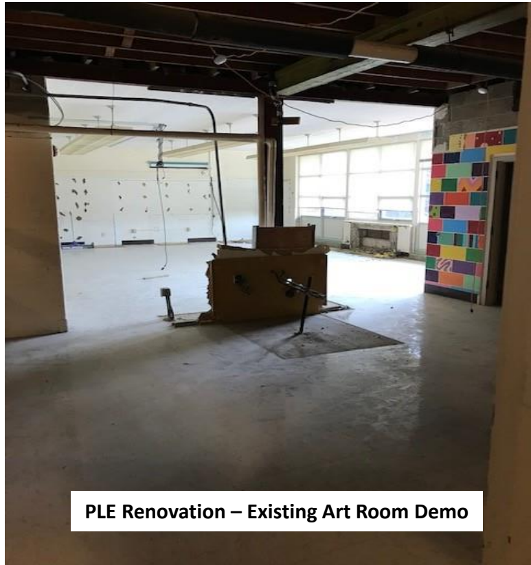
PLE Renovation – Existing Art Room Demo