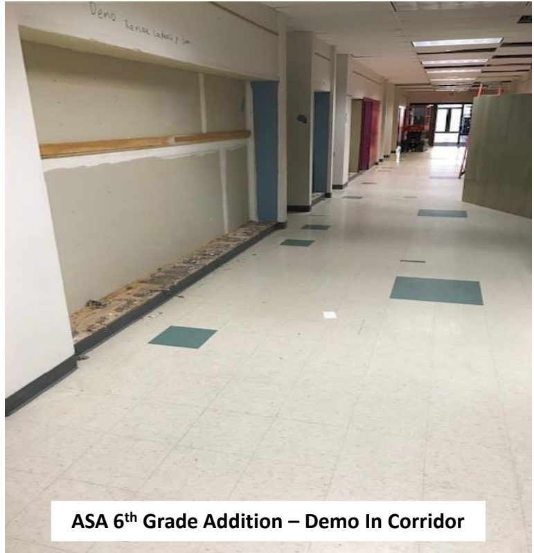
ASA 6 th Grade Addition – Demo In Corridor