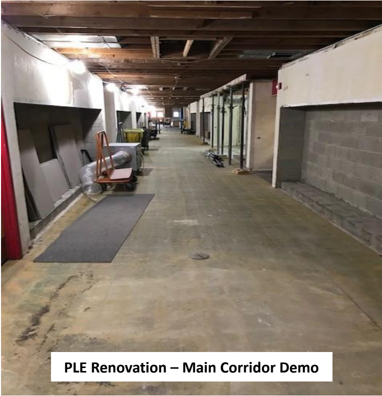
PLE Renovation – Main Corridor Demo