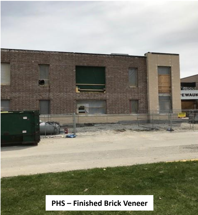
PHS – Finished Brick Veneer