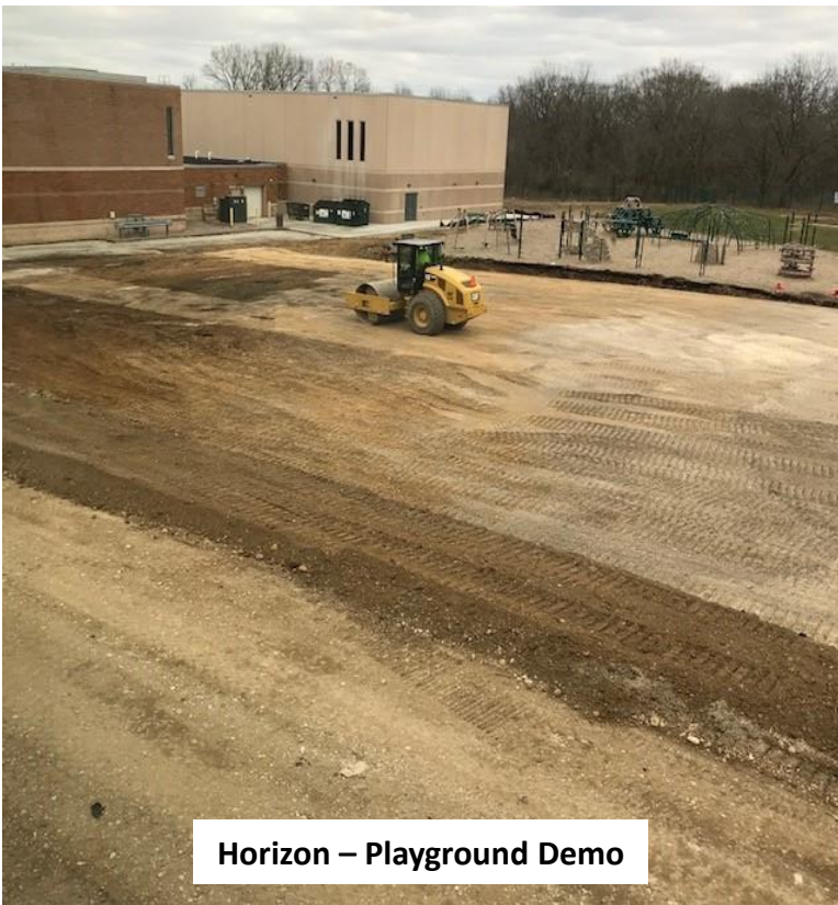
Horizon – Playground Demo