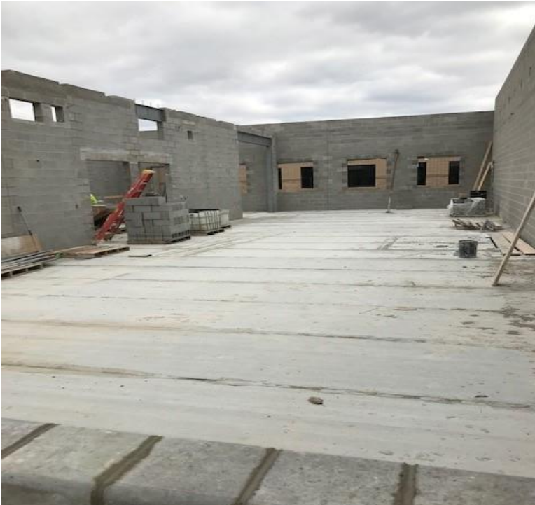
ASA Innovation Addition – 2 nd Floor Load Bearing Wall