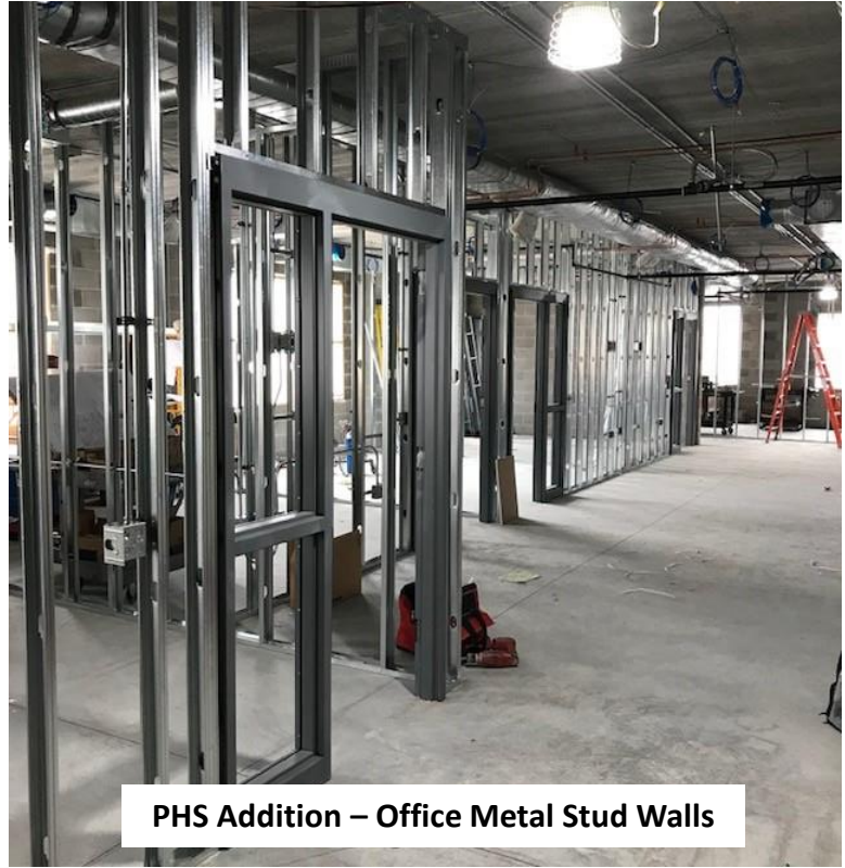
PHS Addition – Office Metal Stud Walls