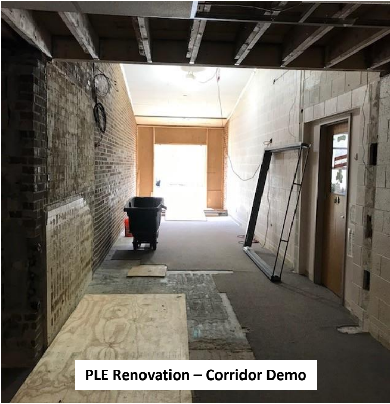
PLE Renovation – Corridor Demo