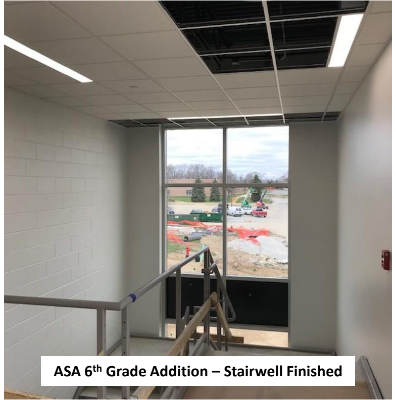
ASA 6 th Grade Addition – Stairwell Finished