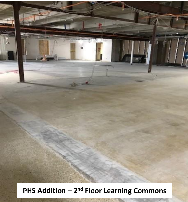
PHS Addition – 2 nd Floor Learning Commons