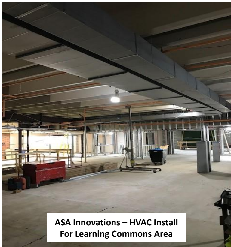
ASA Innovations – HVAC Install For Learning Commons Area