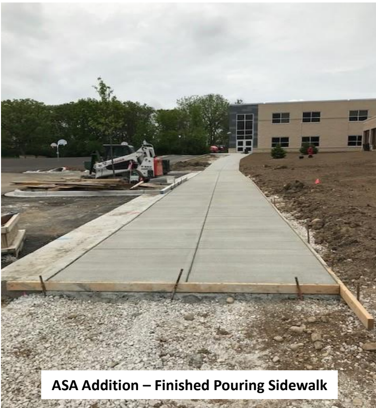
ASA Addition – Finished Pouring Sidewalk