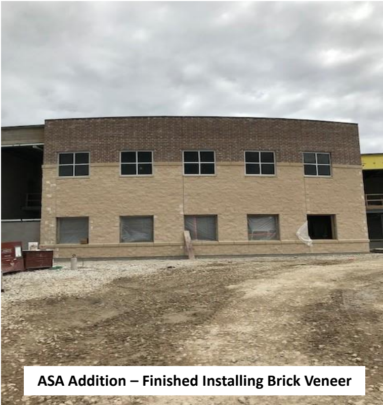
ASA Addition – Finished Installing Brick Veneer