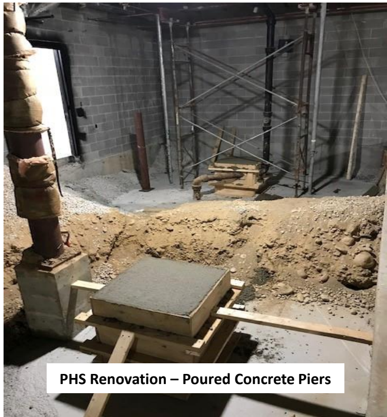
PHS Renovation – Poured Concrete Piers