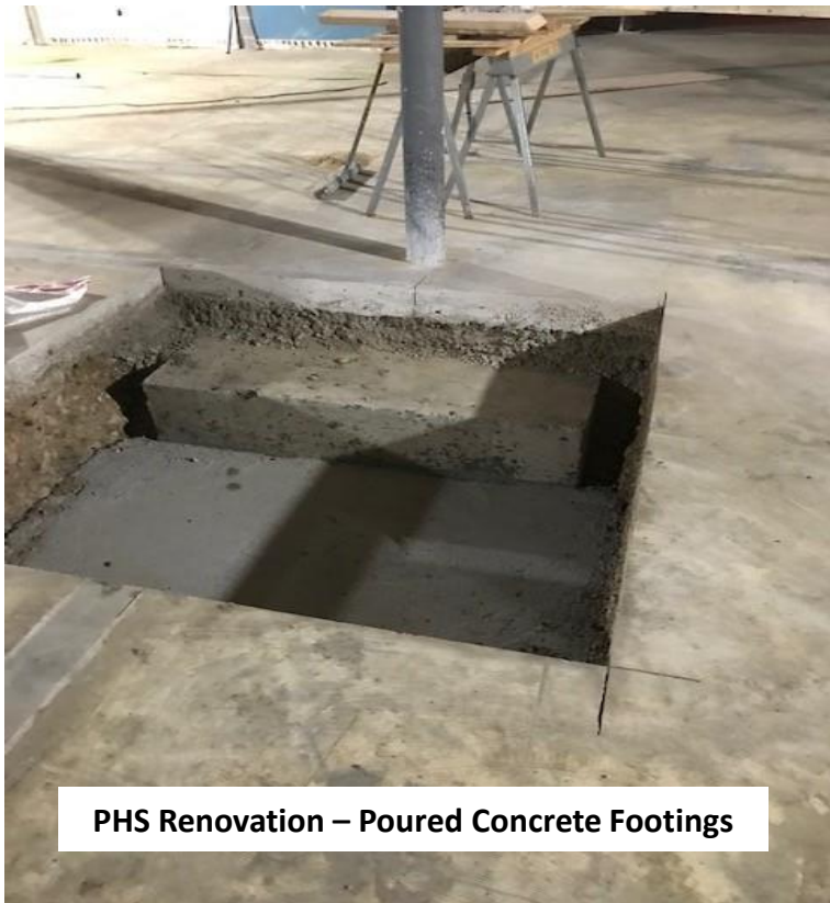
PHS Renovation – Poured Concrete Footings