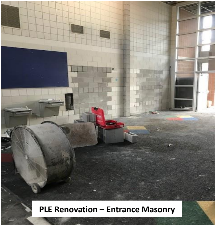
PLE Renovation – Entrance Masonry