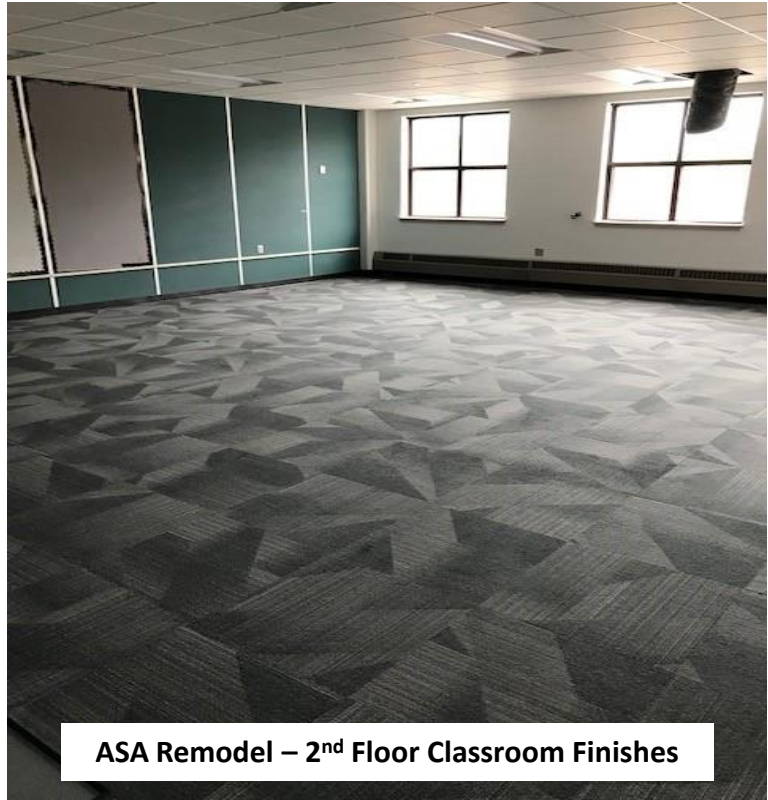
ASA Remodel – 2 nd Floor Classroom Finishes