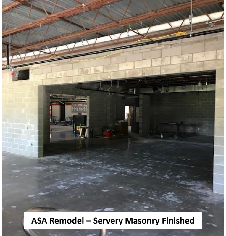
ASA Remodel – Servery Masonry Finished