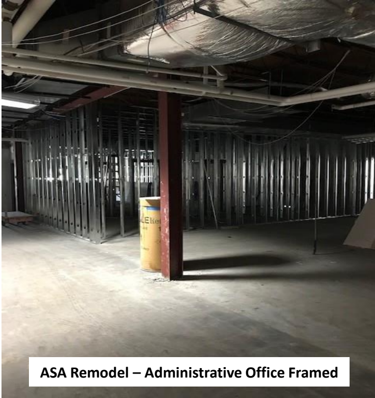
ASA Remodel – Administrative Office Framed