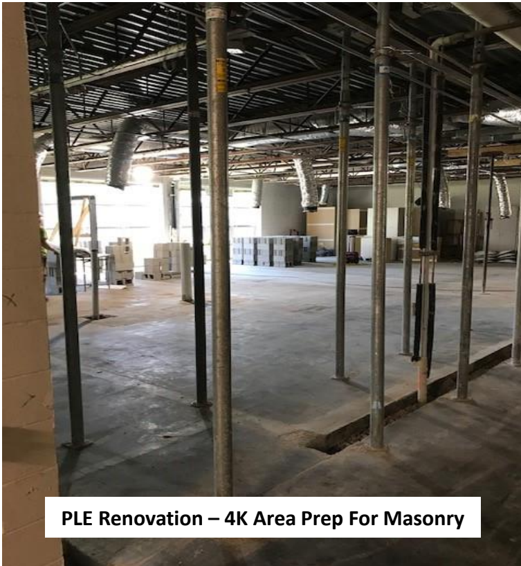
PLE Renovation – 4K Area Prep For Masonry