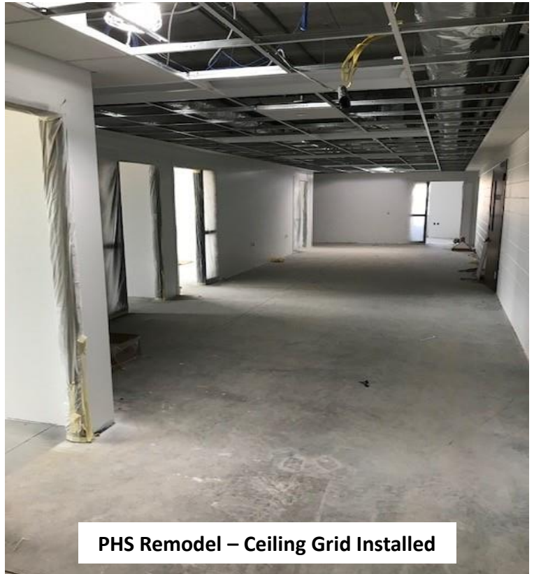
PHS Remodel – Ceiling Grid Installed