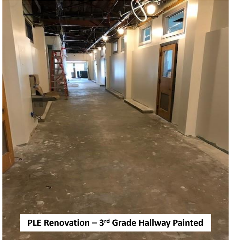
PLE Renovation – 3 rd Grade Hallway Painted