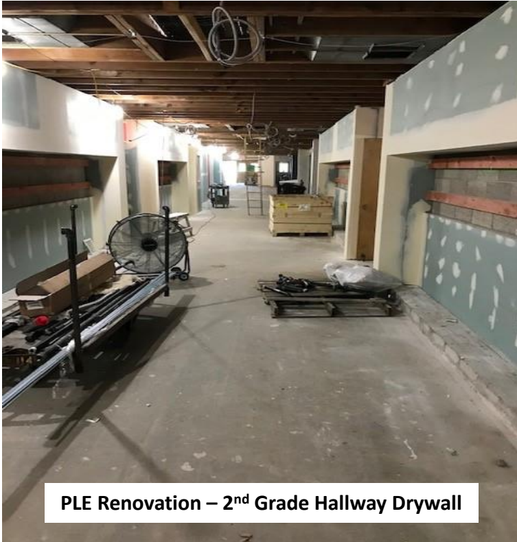
PLE Renovation – 2 nd Grade Hallway Drywall